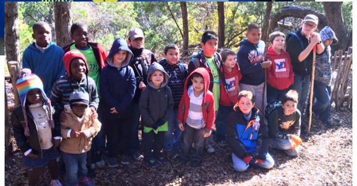
Hike at Cedar Hill Audobon!